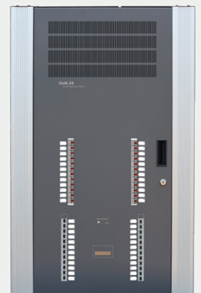
Dimensions: 1000 (H) x 632 (W) x 155mm (D)