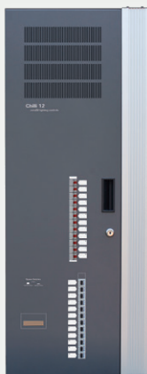
Dimensions: 1000 (H) x 400 (W) x 155mm (D)