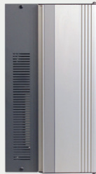
Dimensions: 400 (H) x 220 (W) x 155mm (D)