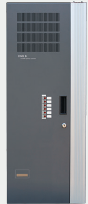
Dimensions: 1000 (H) x 400 (W) x 155mm (D)