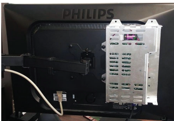
Mounted on standard monitor