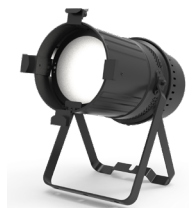
VL800 Eventpar WW